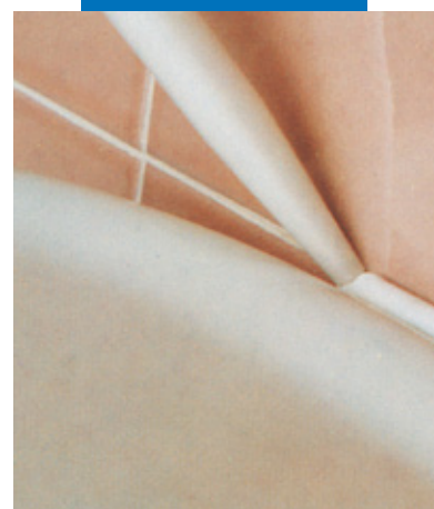
Sealing sanitary ware