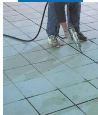
Sealing ceramic tile floor with Mapesil AC