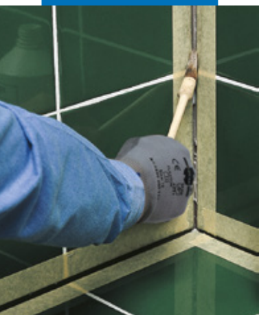
Application of Primer FD