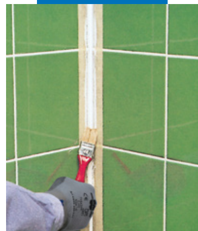
Smoothing the joint with soapy water and a small brush