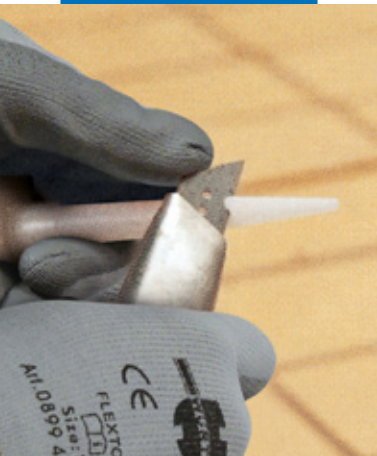
Cutting the nozzle according to the size of the joints