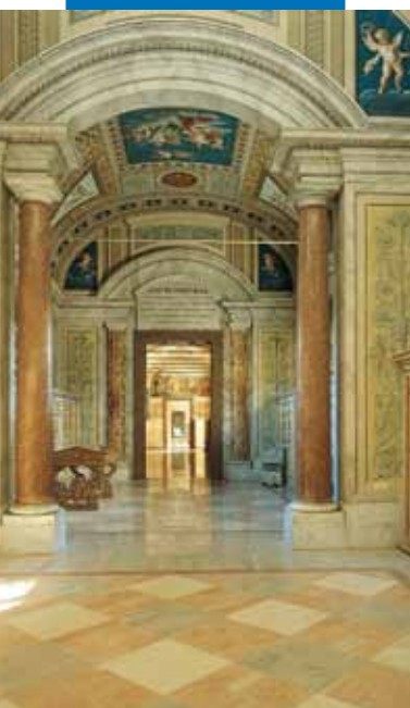
Sistine Corridors - Vaticano - Rome

All relevant references for the product are available upon request and from www.mapei.com