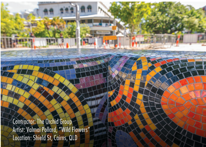
Contractor: The Orchid Group Artist: Valmai Pollard, "Wild Flowers" Location: Shield St, Cairns, QLD