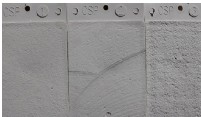
CSP1 to CSP3

All surfaces should be between 4°C and 32°C and structurally sound, clean and free of all laitance, dirt, oil, grease, loose peeling paint, concrete sealers or curing compounds. Rough or uneven concrete surfaces should be made smooth with a LATICRETE Latex Portland Cement underlayment to provide a floated finish, CSP1 to CSP3. Dry, dusty concrete slabs or masonry should be dampened and excess water swept off. Installation may be made on a damp surface. 254 adhesive does not require a minimum cure time for concrete slabs however additional movement joints should be considered for more than normal shrinkage and creep. All substrates must be plumb and true to the required tolerances based on format size of tile. Concrete Surface Profile should be between the ranges of CSP1 to CSP 3. Expansion joints shall be provided through the tile work, over all construction or expansion joints in the substrate. Follow Australian Standards requirements for Expansion Joints in AS3958.1 and 2. Do not cover expansion joints with adhesive.